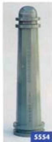
5554 Cast Aluminium