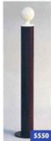
5550 100mm dia.