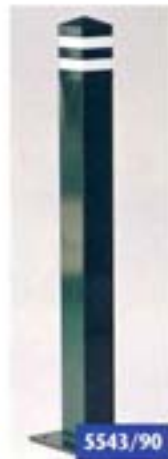
5543/90 90 x 90mm