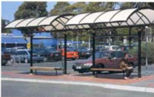
Eastland Bus Shelter