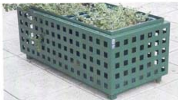
5209 Free standing

Tree guards are a practical and stylish way to protect trees from animals and vandalism. Manufactured in mild steel and then hot dipped galvanised and powder coated, the tree guards can be customised to your streetscape colour scheme. Designs to match existing street furniture or fabrication of a brand new style are also part of the service. The examples shown above are just some of the many designs