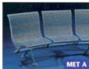
above: Metropolis concave seat