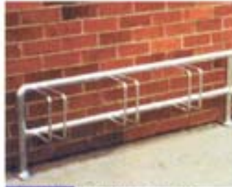
7503/451 Wall mounted