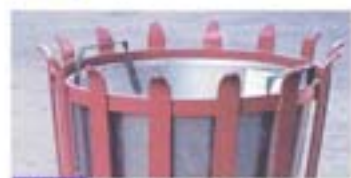
3079 Decorative steel slats