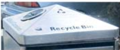
Recycle bin stainless steel entry lid