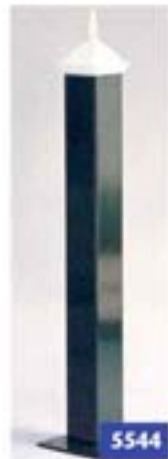
5544 125 x 125mm