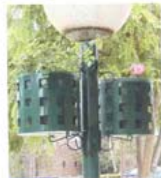
5213 Post/wall mounted