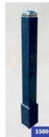
5550 100 x 100mm