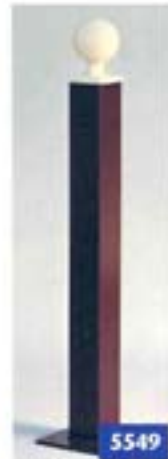
5549 100 x 100mm