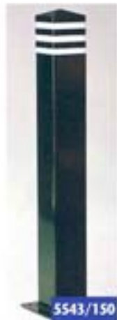
5543/150 150 x 150mm