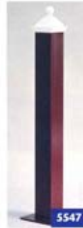
5547 125 x 125mm