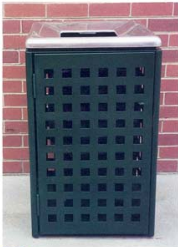
3201 80/120 litre wheel bin surround