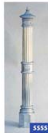
5555 Cast & Extruded Aluminium