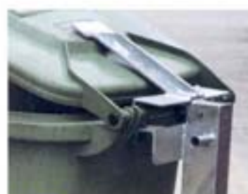
3225 Security Clamp

A variety of timber and steel slatted frames are available to suit 55 or 82 litre capacity. Frames can be tapered or parallel. Galvanised liners, covers & posts available.