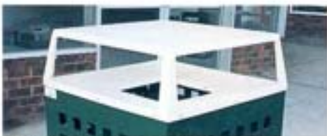
Powder coated four-way covered entry lid