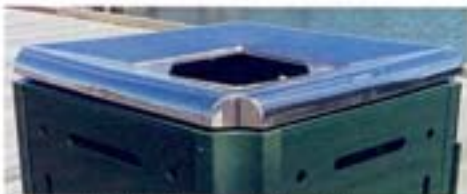
Square style stainless steel entry lid

As experts in this field we welcome the opportunity to work with you to achieve your desired result.