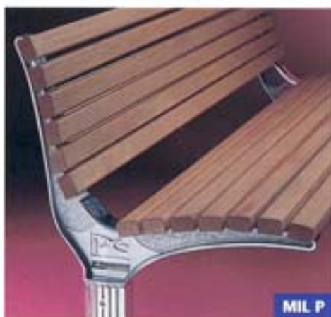
above: Millennium seat with timber slats

Millennium can be surface mounted, free standing or installed in ground and will provide years of low maintenance service.