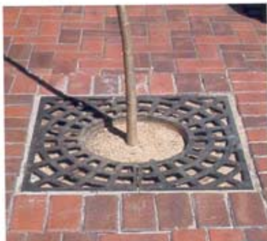
9439 Classic style

Utilising the precision of laser cutting technology, we can design and manufacture tree grates in almost any shape, size or pattern imaginable. Strength and durability are assured by using mild steel which is hot dipped galvanised and coated in bitumen paint after fabrication. All tree grates can be supplied as either two or four part units and come complete with a frame.