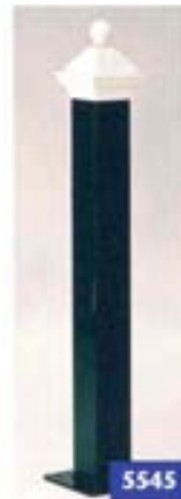
5545 125 x 125mm