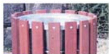
3065 Parallel timber slats