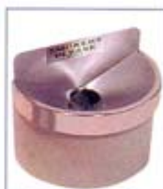
9500 Ash tray