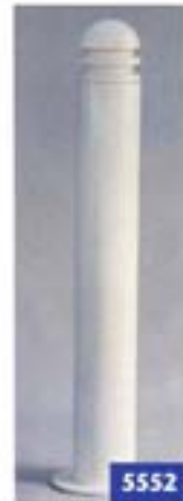
5552 165mm dia.