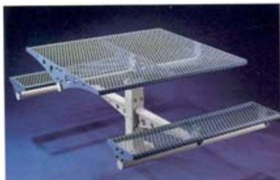
MET J Metropolis