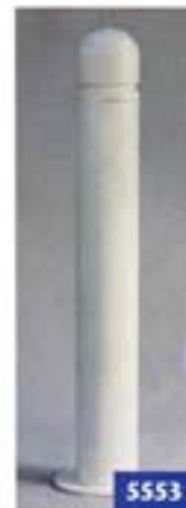
5553 165mm dia.