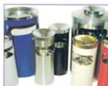
Ash tray waste bins