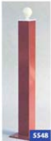
5548 100 x 100mm