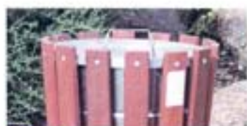
3061 Tapered timber slats