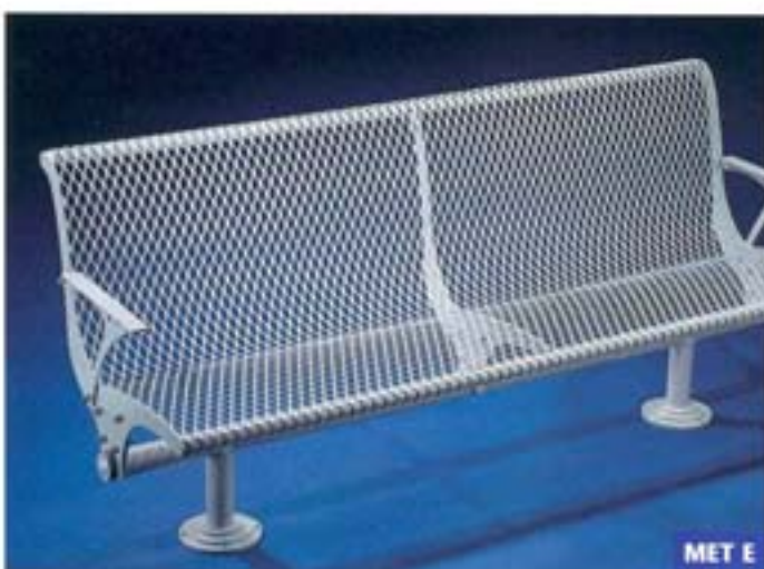
above: Metropolis straight seat