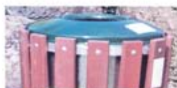
3060 Optional domed cover