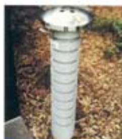
9334 Butt Bin