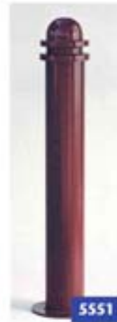
5551 165mm dia.