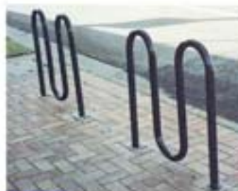
7506/1 'M' type