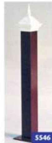
5546 125 x 125mm