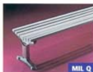
above: Millennium bench