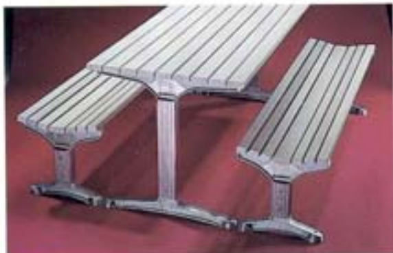
MIL R Millennium