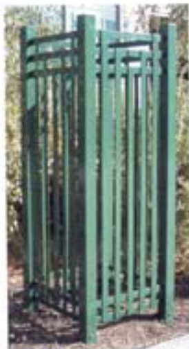
5012 Hardware St