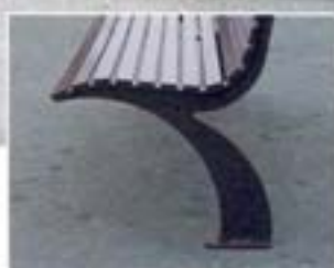
Side profile of seat and bench

Esplanade items featured clockwise from top: bench seat, cast aluminium bollard, park seat and 120 litre wheel bin surround