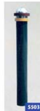
5553 90mm dia.